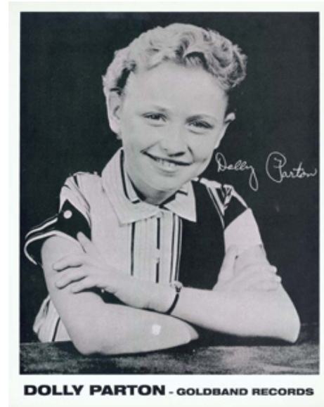
Early Dolly Parton publicity photo, from the Goldband Recording collection in the Southern Folklife Collection.